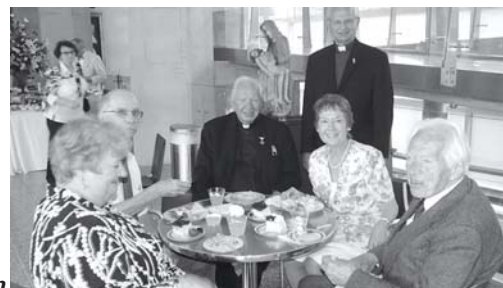
Guests enjoy the reception