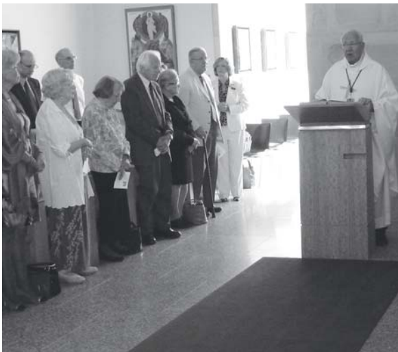
Mass at the Chapel of the Center